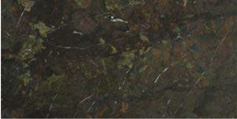
AMARULA POL. RECT. 60X120 / 24"X48" P34/M